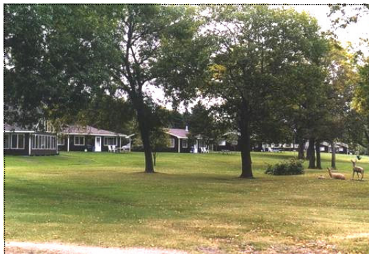
Weslake Resort, Underwood, MN