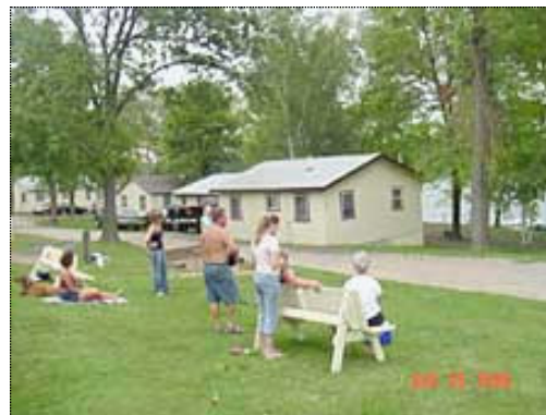
Northern Lights Resort, Richville, MN