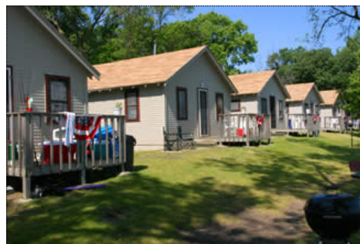
Sand Bay Resort, Battle Lake, MN