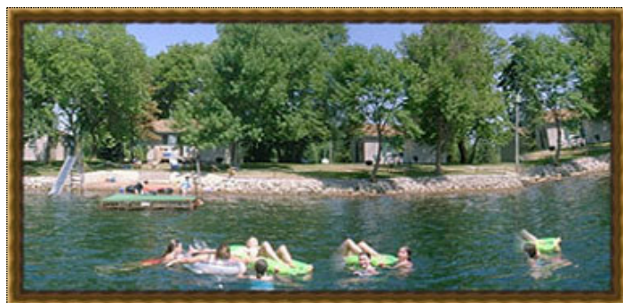
Big McDonald Resort, Dent, MN