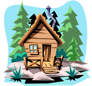
Resort Tour September 27, 2005

Please watch for more information to follow in the September newsletter! This will be a great tour with three beautiful resorts to learn from. We would like to thank these resorts for their participation.