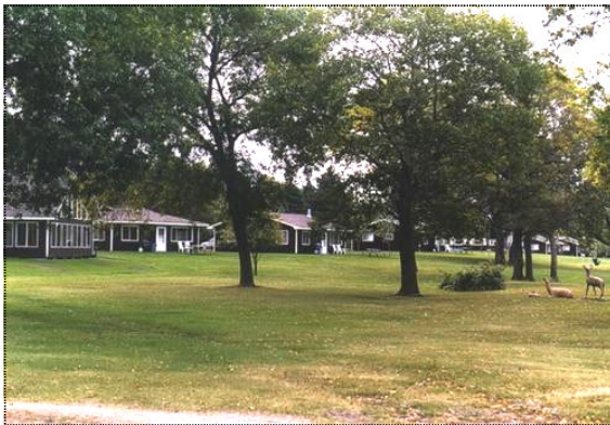
Weslake Resort, Underwood, MN