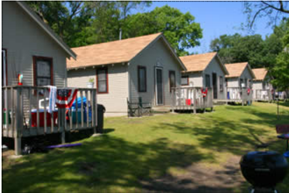
Sand Bay Resort, Battle Lake, MN