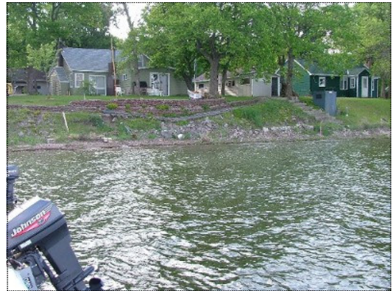
Fisherman's Village Resort, Battle Lake, MN