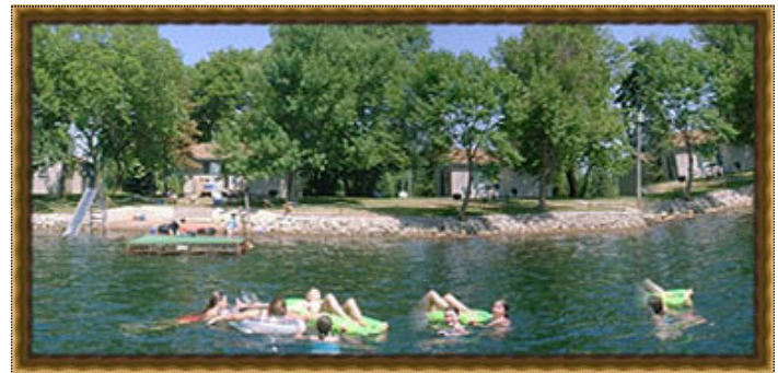
Big McDonald Resort, Dent, MN